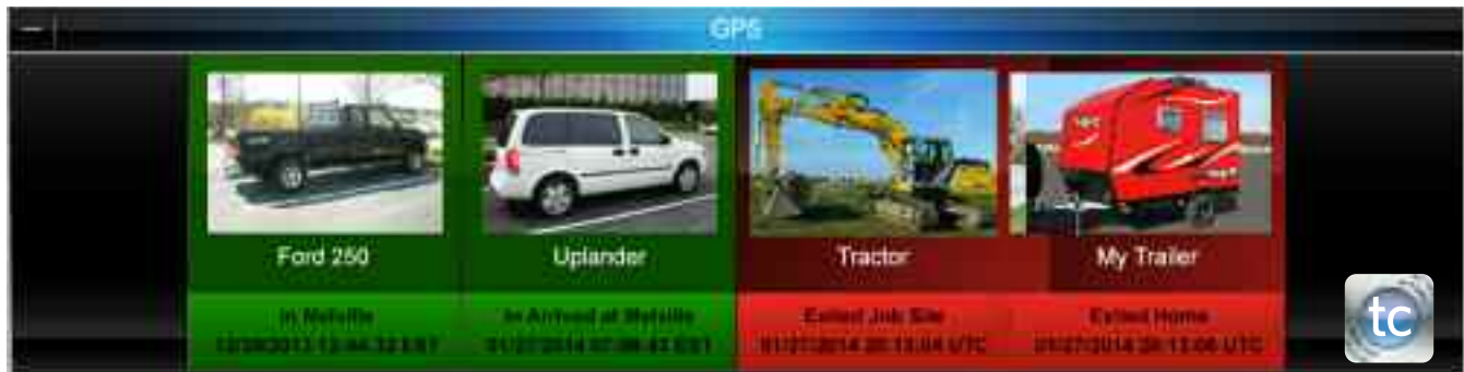
Honeywell Total Connect 2.0 Tracking Services Dashboard

Honeywell Total Connect Tracking Services provide on-demand vehicle/asset location, location history, programmable speed alerts (vehicle alerts), customized notifications based upon entering or exiting a designated area and more. The option to upload an image of the user's vehicle or asset in the account is available.